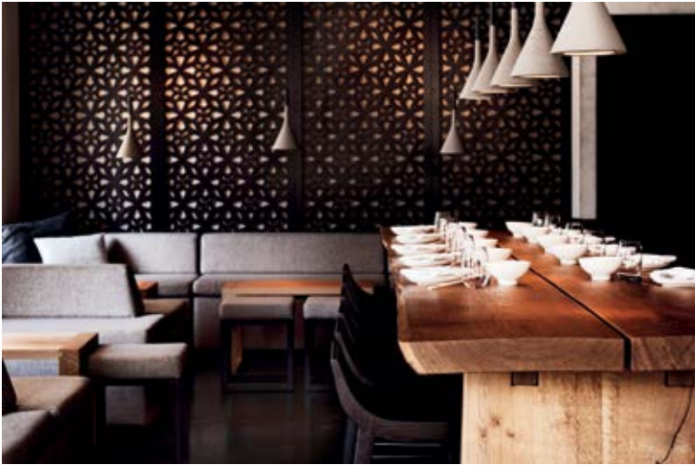
LONG COMMUNAL TABLE & LOUNGE