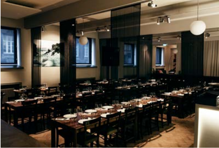
RESTAURANT AND BAR

Farang offers versatile facilities for both small and large groups.